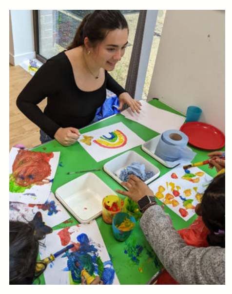
Click <u>here</u> to find out more about our impact.

Abbey Community Centre, 172 Belsize Road, Kilburn London NW6 4BJ