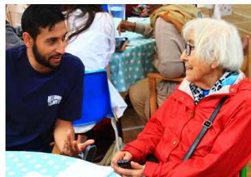
Pictured left: Tech Buddies session

Please be aware that the centre will be closed on Friday 19th April until Monday 22nd For Easter. We are also closed on Monday 6th May for the bank holiday.