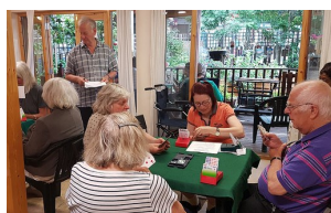
Pictured left: Bridge Club

1.30-3.30pm: Bridge Club - tutored session to learn the basics of this card game but all abilities welcome.